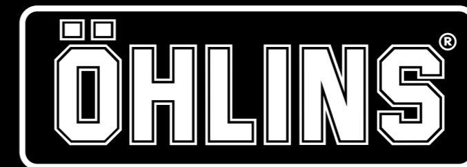
ÖHLINS BLACK/WHITE MEDIUM