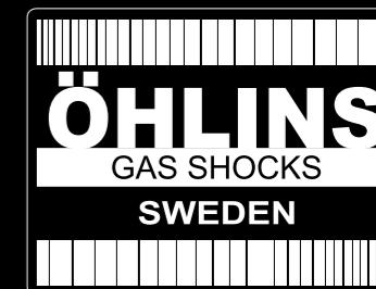
ÖHLINS RETRO WHITE