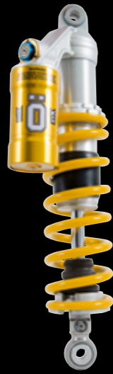
STX 46 SHOCK ABSORBER