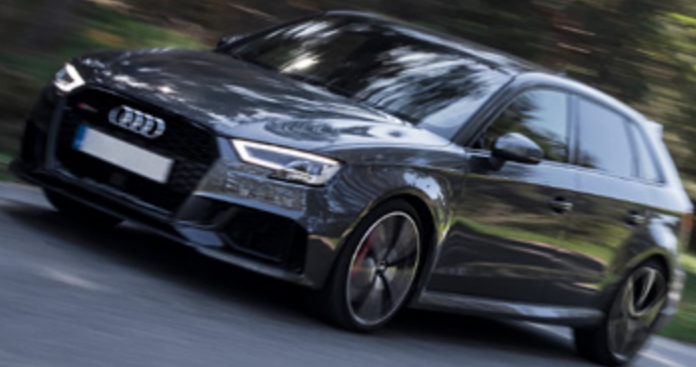
ROAD & TRACK