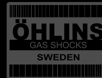
ÖHLINS RETRO BLACK