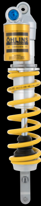
TTX FLOW SHOCK ABSORBER