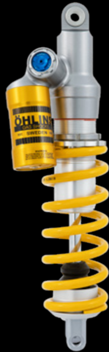
TTX FLOW WITH PDS SHOCK ABSORBER